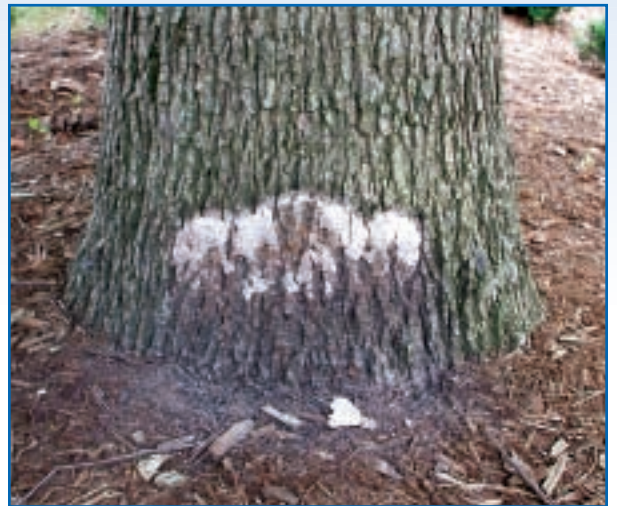
Saprophytic fungus has spread from mulch to trunk, but it has no affect on structure.