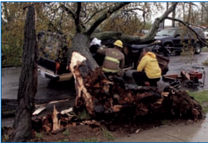
This sugar maple ( Acer saccharum ) had beautiful leaves, but root damage had resulted in decay. The arborist who cleaned dead branches the year before was not paid to assess risk.

✓ Trunk. If there is a hole in the trunk or root collar, you can gain information about that cavity by probing with a tool such as a screwdriver or a tile probe, a long, narrow fiberglass rod with a "T" handle. A ruler or yardstick will give you some idea how extensive the cavity is. If the trunk sounds very hollow but there is no soft spot or opening to probe and measure, then more advanced equipment may be used to determine how much sound wood is in the stem. Drilling and coring can measure the sound wood in one small area, so many holes must be made to get a picture of the whole tree. Drilling (including resistance measuring devices) and coring invade healthy tissue, potentially spreading decay and decreasing stability. Practicing on fallen trees can provide valuable experience in the use of these methods.