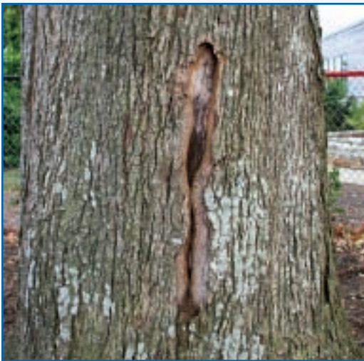
Wounds from grader gash, aka “bulldozer blight.” When closure takes place before the wood decays, risk is low.