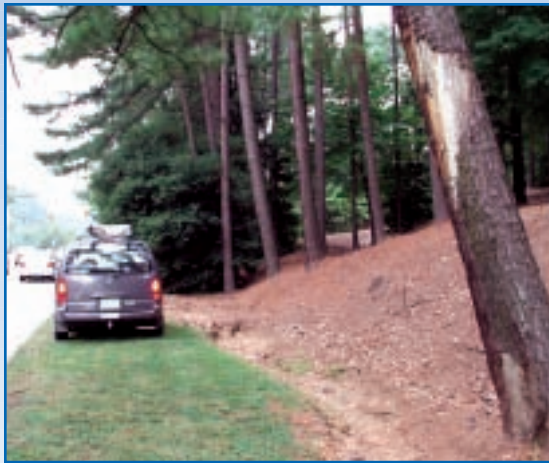
Wounds larger than one-third the circumference in plan of lean over a busy road create a high-risk condition.