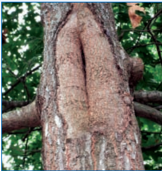
Woundwood is strong, but a rapidly closing wound can form "ram's horns," which can cause splitting in the future.