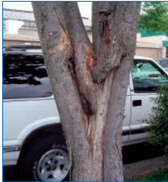
This codominant fork with a cracking wound is a high-risk condition.