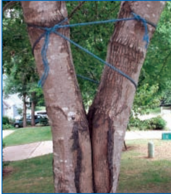
After a hurricane ten years ago, the home owner managed the split with rope and pruning paint. Now the rope is swallowed, creating a new risk of failure.