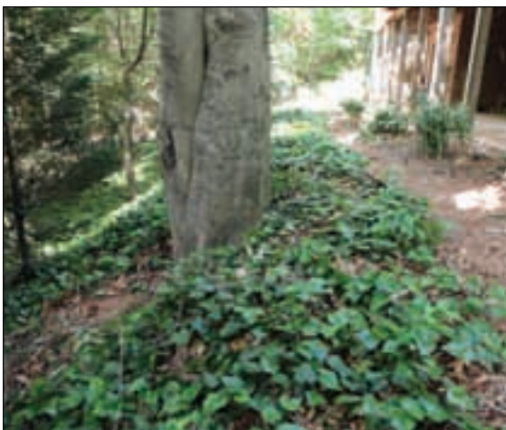
For 19 years, clay has pressed against this beech tree's thin bark. Is the uncharacteristically rough bark caused by mechanical damage, or the fill? What will our team's excavation expose?

"Your tree seems strengthened by that "washboard" growth, and only slightly weakened by pressure and decay from the clay fill," I observed, showing Wanda our work. "We can see the roots in this surrounding clay proliferating where there is more air and organic material, near the trunk. The clay smells sour like anaerobic bacteria, so it is low in oxygen. We will examine the insect activity at these holes, and the apparent