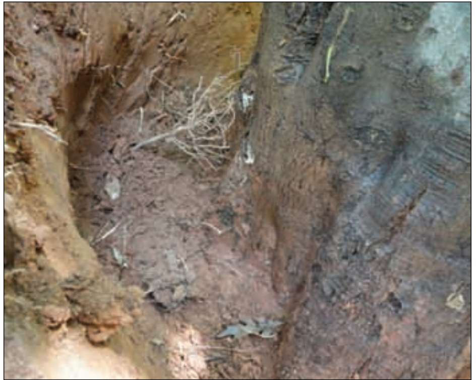
The root collar excavation, RCX, exposes an adventitious root turning inward to feed on decaying (white) patches of bark. The tree was demonstrating the ultimate in recycling as it harvested its own resources, but even this natural invasiveness is not a good thing.

"Check out the washboard pattern, like the muscles on a well-exercised abdomen," Chamomile said, thumping his belly. "Reaction