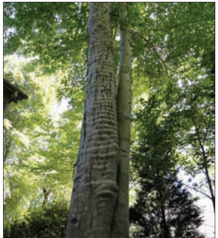
A column of bulges runs up the back side of the beech, facing away from the home and toward the forest.

“I haven’t seen a lot of bird activity,” Wanda said, twirling her finger skyward. “The former owners used radios for long-range communication. Maybe they attached antennae to this tree with semicircular clamps. Or could it be a genetic mutation that is only expressed on one side of the trunk... or burls made by wasps laying eggs?”