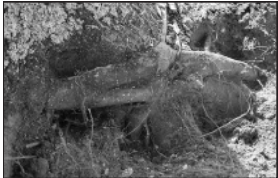
Figure 3. Underneath the first stem-girdling root there are often more. All the roots crossing the stem and buttress should be removed.

Roots that circle the trunk instead of growing away from the trunk injure the tree by reducing transport of water, minerals and sugars where the root presses against the trunk. The injury increases with time, often leading to tree decline. When a root collar examination (RCX) is done, the number of SGR's associated with tree decline and/or sudden failure is amazing. In Kentucky, consulting arborist Dave Leonard uncovered SGR's as contributing to the death of a sugar maple, Acer saccharum . After the property owner witnessed what the tree looked like underground, he wanted his other 39 struggling sugar maples assessed. Leonard found only two with "normal" root systems, free of significant SGR's (Meilleur 2007).