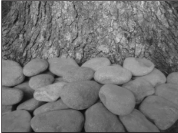
Figure 7. Root crown examinations can expose sensitive tissues, but replacing soil can infect wounds and trap excess moisture. Restoring the grade with smooth stones can add aesthetic appeal while allowing air and light penetration.

An ounce of prevention in the nursery, or four ounces of inspection at buying time, or eight ounces of correction at planting time can prevent a ton of work. In the end, it falls to the arborist to find the flare, examine the root crown, and prune stem-girdling roots. It may be hard, dirty work, but the results become obvious over time. Pruning defective roots grows healthier trees, so it's time to stop discussing and start practicing this simple yet important procedure.