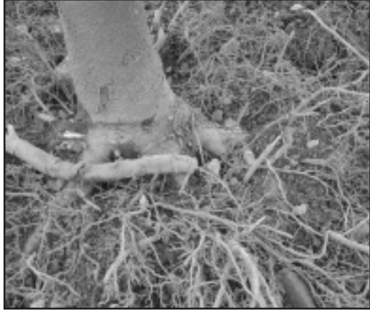
Figure 2. Compression over two buttress roots was relieved by severing one girdling root. Air excavation can dry out roots that are not threatening the stem. Soil should be replaced immediately after inspection.

Many tree planters do not find the flare, instead matching the soil line to grade and adding more soil and mulch to the stem. This practice may serve to guide roots upward and inward into nursery soil where oxygen and fertility levels may be higher than they are outside the prepared planting pit. These roots can girdle the stem as they elongate, with disastrous consequences. Trunk tissue is compressed, weakening the tree’s structure at the tree’s fulcrum (Figure 2). Nutrient flow through the phloem is slowed, weakening the tree’s overall health (Costello et al. 2003; Urban 2008). There is currently nothing in either the Z60.1 or the A300 standard about the making sure major roots are growing away from the stem, although A300 standards on tree root care are being developed.