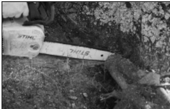
Figure 6. A chainsaw with a narrow bar can rapidly "plunge cut" girdling roots. Following standard safety techniques, the operator can make the cut gradually. Sensing the root's release, the operator can pull back in time to avoid damaging stem tissue.