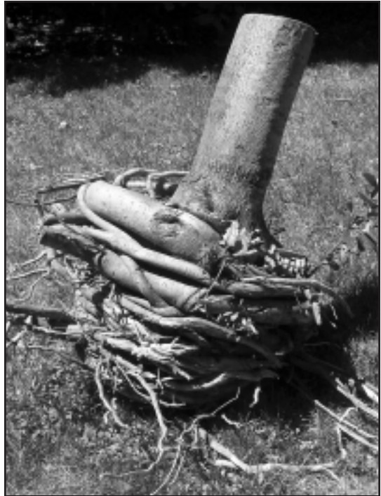
Figure 1. When the severity of the problem is made visible, it is easier to understand the importance of inspection and correction of roots at planting time.

Many North American nurseries also encourage a well-branched root system this way in both field and container production. The American Standard for Nursery Stock (anonymous 2004) currently does not discuss root pruning, but it does require that