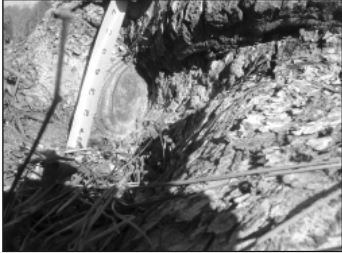
Figure 4. A buttress root was damaged by construction 18 years previous, and a girdling root grew. One year after pruning, callus forms all around the wound, and more new orange tissue bulges over the girdled area. By sight and touch, this area appears relatively unchanged, indicating that severely compressed tissue is slow to recover.”

delicate surgery can be done by crewmembers. Many workers enjoy working with the lower part of the tree for a change, and also being trusted with increasingly technical procedures. Dave Leonard's 2-person root crew alternates between the air excavation tool and hand tools, which makes sense for reasons of ergonomics and morale.