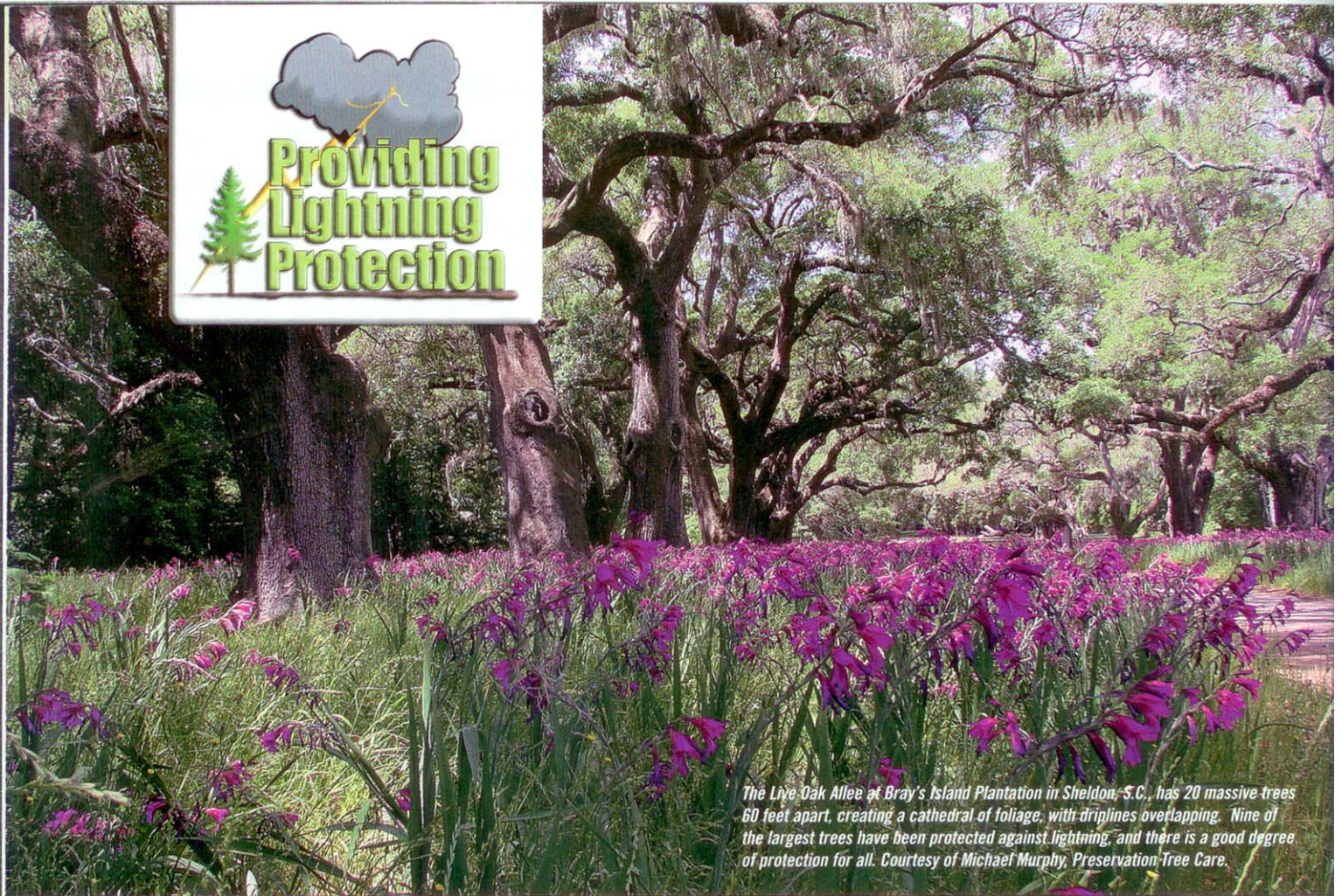
The Live Oak Allee at Bray's Island Plantation in Sheldon, S.C., has 20 massive trees 60 feet apart, creating a cathedral of foliage, with driplines overlapping. Nine of the largest trees have been protected against lightning, and there is a good degree of protection for all.