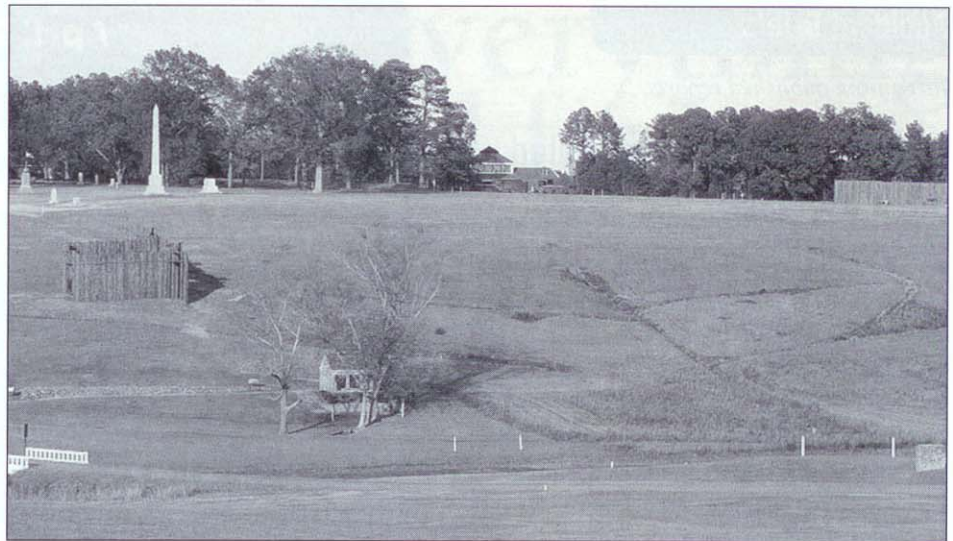
The Andersonville site, where 33,000 prisoners were packed into 25 acres in 1864. The grove of trees on the hill overlooking the prison have historical importance, and will be protected.

On another job, installation was delayed because of a horse disease! Murphy was told that his crews could not enter a paddock area to access a tree until the disease was controlled, for fear that they might spread it to other horses. The paddock live oak is 60 feet tall with a 130-foot spread. An inspection showed at least one old lightning strike. The importance of this tree for the horses as well as the homes nearby made $4,730 for this installation worthwhile. Due to the enormous spread, there will be two main air terminals to ground with 32-strand cable, and eight additional air terminals with 14-strand cable. For extra protection, they chose to upgrade their system from the minimum standards set forth by ANSI A300 by using 32-strand