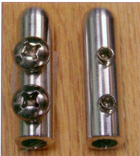
Blunt-tipped air terminals have been proven more effective at drawing lightning strikes than sharp tips. Suppliers have responded with these prototypes.

ley between the buttress roots. The conductor's path through the ground is not that important, because root damage from ground conductors is rare. The function of the ground rod is critical, so it must be deep enough to be adequate. Bones uses an auger to start the hole for the ground rod. If