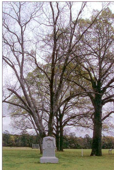
Andersonville National Historic Site in Andersonville, Georgia, has purchased material to protect at least 15 veteran trees from future lightning strikes.

no place or tree is immune. Also, there are microsites elsewhere that receive numerous strikes. The west-facing slope of the Morris Arboretum, above the University of