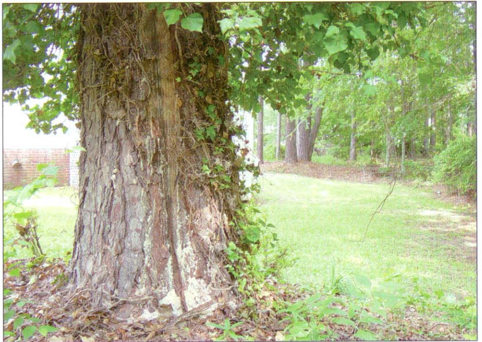
A typical lightning “scar” serves as evidence of a previous lightning strike.

With lightning systems, blowing a fuse can be a good thing. The researchers at Bartlett wanted to know if their systems worked, so they shopped around for specially made lightning counters, devices designed to track and record the number of lightning strikes. The price of $100 per counter seemed a little high, so they designed an induction loop with low amperage fuses. Working with the Franklin Institute in Philadelphia, Graham developed a similar device, also using household-type electrical wire and a fuse made for vehicles. He noted that fuses