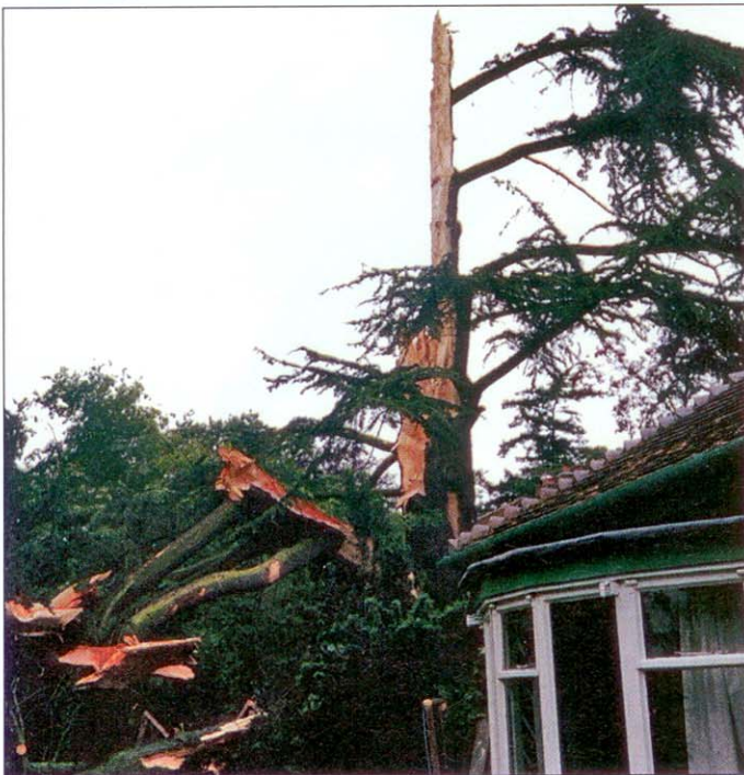
A lightning damaged cedar.

If the tree is in a lawn or an area with a lot of activity, the cable should be in a val-